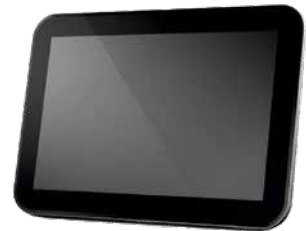
RBUEt Oe Diagnostic