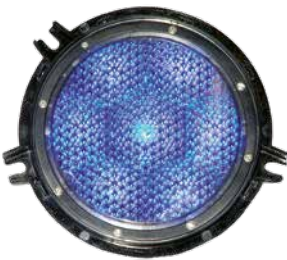
LED signal EU for rail applications