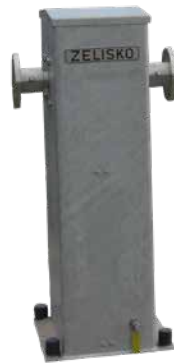
Complete barriers with drives for 24 V DC supply voltage

Complete roadside signals with different lamp technologies, e.g. incandescent lamps with single or double filament, double halogen lamps or LED